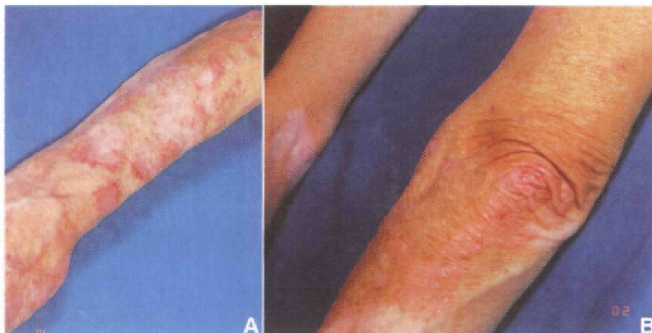
Fig. 1. Annular papulo-erythematous areas with (A) scales and a hypopigmented central zone, and (B) erythematodesquamative lesions recalling psoriasis and vitiliginous patches.

Psoriasis has been said to associate with other autoimmune dermatological diseases in 0.74% of cases (5). Its coexistence with lupus erythematosus (LE) is,