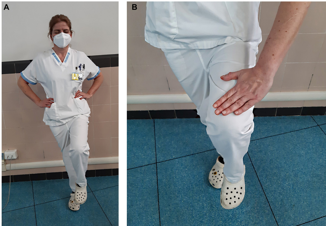
Figure 2: (A) The image illustrates the first step of the test in which the person raises her leg with her eyes closed and hands on her hips. (B) The image illustrates the second step of the test, in which the person lifts his leg with his eyes closed and his hands on his hips, while an operator places his hand to put slight pressure against the lifting of the leg.

of the clinician's experience, in tandem with the patient's experience with the treatments received, have equal value compared to what is achieved in the experimental research clinic [51].