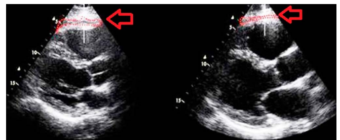
FIGURE 1. Echocardiographic assessment of epicardial adipose tissue. The left side is an end-systolic image, where EAT is more represented. The right side is an end-diastolic image, with the minimum thickness of EAT.

The EAT was measured in a parasternal long-axis view, on the top of the right ventricle free wall, considering the maximum thickness, as end-systolic measurement (Fig. 1). In the evaluation of the CV profile, we also included a carotid ultrasonography, with a Doppler linear probe, for the evaluation of the IMT. Specifically, IMT was measured at common carotid level 1 cm before carotid bifurcation in both right and left carotid arteries, using on average all the 2 measurements. All measurements were performed by FM. Inter-observer variability for EAT, LV ejection fraction, and IMT were calculated in 10 randomly selected examinations. A second observer (C.D.A.), who was blinded to the initial analysis, repeated all measurements for quantification of interobserver variability.