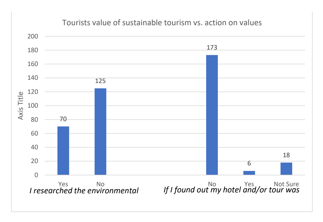
Figure 5. This graph shows that while tourists are not actively pursuing eco-friendly resorts or tours, they are willing to take action on those values.