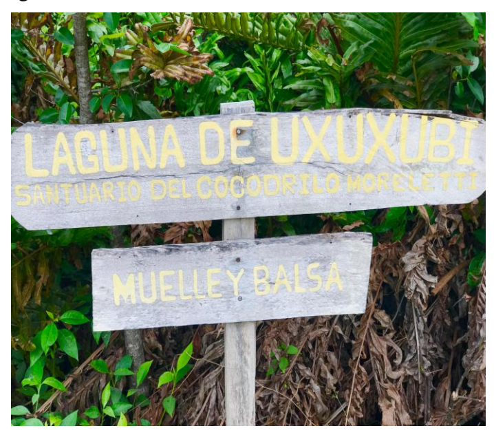
Figure 6. This sign at Uxuxubi reserve directs people to the crocodile lagoon, where they can swim with crocodiles in cages.

Figure 5. This graph shows that while tourists are not actively pursuing eco-friendly resorts or tours, they are willing to take action on those values.