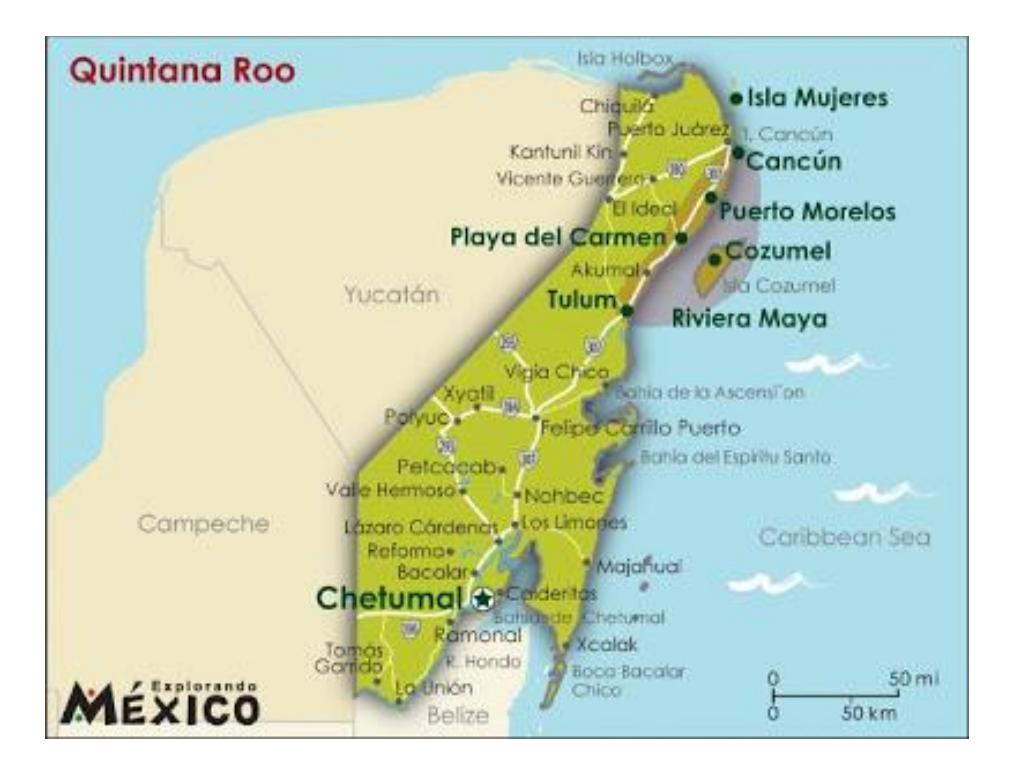
Figure 3. A map of the Yucatan Peninsula. The state of Quintana Roo contains popular tourist destinations such as Cozumel, Playa del Carmen and Cancun. Puerto Morelos is located in the Riviera Maya.