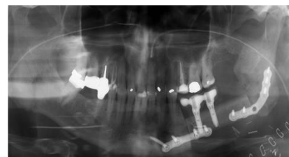
Figure 8: Post-operative panoramic radiograph showing the well-planned segmentation of the fibula and resection of the mandible. Also, the bridge is well-seated on the implants.

Secondary reconstruction of maxillo-mandibular defects using a prefabricated fibula always implies that the patient must be willing to undergo at least two surgical procedures. It is possible to reconstruct such defects without pre-planning and insert implants directly or separately at a later stage. Schmelzeisen et al. 11 have shown that without pre-planning, the positioning of the implants becomes a major problem; implants could be used without placement of more implants in only two of the