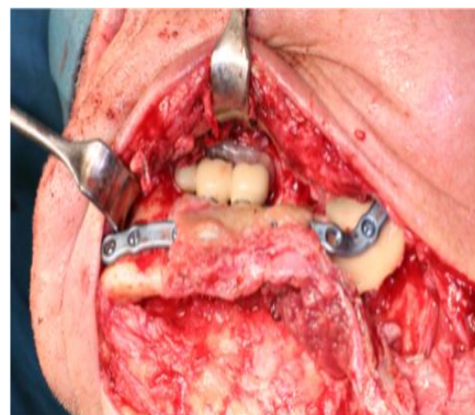
Figure 6: Fixation of the fibula was performed with 2.4 mm reconstruction plates. A positioning splint was used to position the bridge and graft out of the occlusion.

graft to the jaw (Figure 7). The skin graft was sutured to the oral mucosa. The patient was discharged from the hospital one week after surgery. A post-operative panoramic radiograph showed the favourable fit of the bridge on the implants (Figure 8).