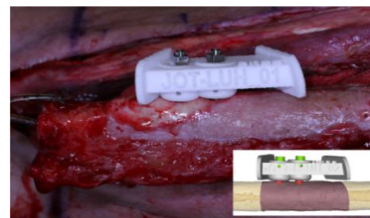
Figure 4: Selective laser sintering model of the cutting guide fixed on the implants with Nobel guide fixation screws in the left fibula. The insert shows the virtual cutting guide.

with the original fibula planning, thereby creating a superimposed fusion model with the accurate position of the implants. The resection margins of the fibula were optimised according to the post-operative CBCT scan of the head. An implant-supported cutting guide of the fibula was then planned and printed (Figure 4). A digital design of the custom bridge abutment was virtually planned on the scanned position of the implants and subsequently converted to a stereolithography (STL) file from which the bridge abutment was milled out of titanium (E.S. Healthcare). The titanium structure was tested on the cast retrieved from the conventional impression and fitted without tension. To position the implant-supported bridge in the correct dimension to the upper and lower dentition, an intermediate occlusal guide with an extension to the implants was virtually planned in Simplant and printed in an STL model (Figure 5). The occlusal guide functioned as an implant positioner in the articulator to finish the bridge with composite. The bridge was planned out of occlusion to keep occlusal forces from interfering with bone healing of the fibula.