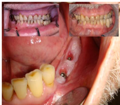
Figure 7: The insert on the left shows the positioning of the bridge, which is deliberately made out of occlusion in the consolidation period of the fibula bone to the mandible. The bridge is finished with composite. The insert on the right shows the bridge after the healing period; the composite was corrected to a better occlusion and crown shape. In the future, the bridge will be finished with ceramic in a more ideal shape. Three months post-operative, the peri-implant soft tissue created by the split skin graft shows a favorable attached lining.

graft was situated intra-orally using a positioning wafer, which was made out of occlusion to prohibit occlusal forces during the consolidation time of the fibula