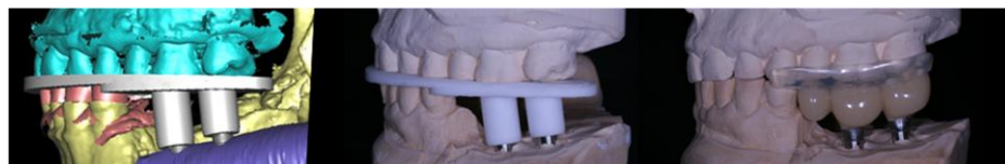
Figure 5: An intermediate positioning wafer is shown, which is virtually designed in between the upper and lower dentition and the implant position (left panel). The purpose of this wafer is to translate the implant position and virtual planning of the fibula to the articulator. The occlusal guide printed in an STL model in the articulator (middle panel). The implant-supported bridge is fabricated in the correct dimension to the upper and lower dentition to prohibit transmission of occlusal forces on the fibula graft during consolidation. The bridge is deliberately made out of occlusion; a partial occlusal splint maintained this interocclusal space during positioning and fixation of the fibula segment (right panel).

prefabrication procedure to give the implants sufficient time to osseointegrate. The fibula with the implants was harvested while the vascular supply of the fibula stayed intact; the osteotomies were performed using the implant-supported cutting guide. After the osteotomies were performed, the bridge connecting the implants was screwed into place. The edge defects can be optimised to fit the reconstructive planning exactly using cutting guides. The prefabricated fibula with the bridge in place was detached from the veins and placed in the mandibular defect (Figure 6). The