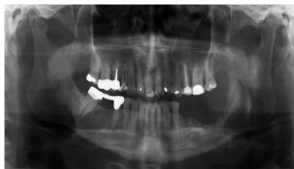
Figure 1: Panoramic radiograph showing osteolysis due to osteoradionecrosis of the left corpus of the mandible and a pathologic fracture. In the upper and lower jaw, a natural dentition is present with a bridge in the mandible from the second premolar to the second molar and absence of the second premolar and all molars on the left side. Periradicular healthy bone is present, and the periodontal chart revealed no pockets or bleeding on probing the remaining dentition.

The patient was offered two options: a local resection of the diseased bone combined with a conventional