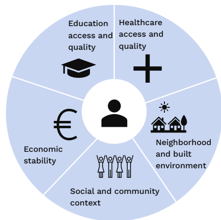
Figure 1. Social determinants of Health, adapted from Healthy People 2030 (Healthy People 2030, U.S. Department of Health and Human Services, Office of Disease Prevention and Health Promotion. Retrieved April 26, 2023, from https://health.gov/healthypeople/objectives-and-data/social-determinants-health ).

To summarize, investment in social determinants and broader determinants (e.g., built environment and commercial determinants) of health in disease prevention and health promotion could benefit the health and prosperity of both individuals and society as a whole (Figure 1)(67, 69). Moreover, additional support and engagement for groups with the greatest health deficit and need, such as individuals with low SES and older adults,