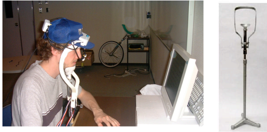
Figure 1. Experimental set-up

Since subjects are required to have eyesight over 1.0 to record eye movements with our eye-mark recorder, an eyesight check is done before the experiment. An illustration of the recording of the eye tracking data with the above equipment is shown in Figure 1.