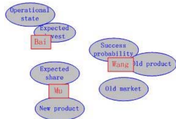
Fig. 3 The new two-dimension snapshots

After the brainstorming stage, the two-dimension snapshot may be figure 3 below. Brainstorming stage may be limited, because too many focuses may be harmful for decision efficiency.