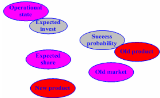
Fig. 5 The two-dimension focuses snapshot

Based on the three-dimension snapshots, the conflict focuses should be found out to remind the participants that there may be seriously conflicting opinions about the problem, so a two-dimension focuses snapshot should be presented to facilitate the decision process by focusing the discussing on the differences of the opinions, which may enhance the efficiency and effectiveness of decision.