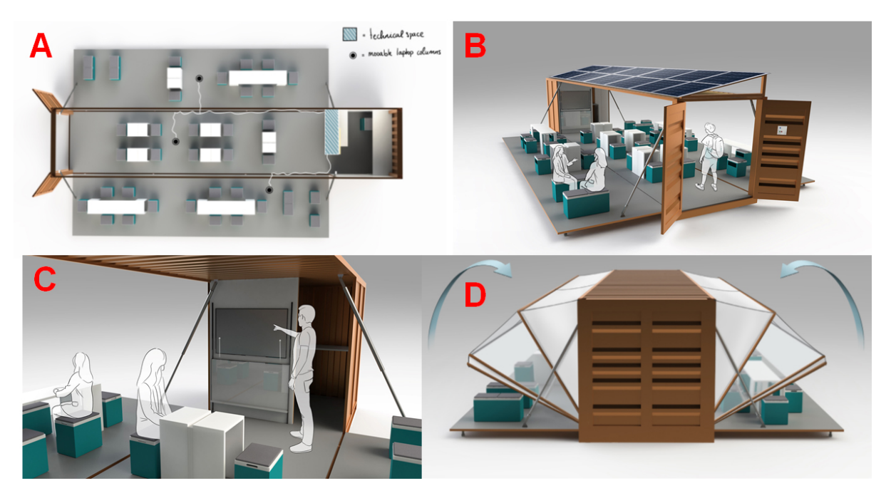
Figure 1. A: top view of the EduBOX; B, C: 3D view of the EduBOX; D: view of the canopy structure.

The final design of the self-contained learning environment exists of two main parts; the first part includes opening sidewalls to expand the classroom's area while the second part includes a small lab in the back of the container behind a separating wall (Figure 1). Figure 2 illustrates the outside dimensions of the EduBOX.