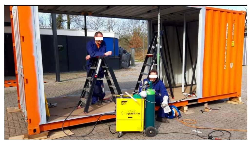
Fig. 3: Prototyping of the EduBOX

This way, it will fit most education programs and can evolve with the societal transformations, which will make the design more durable.