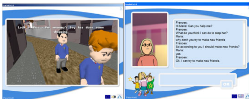
Figure 1 FearNot! screenshots of male verbal bullying episode and female making new friend user interaction episode (English version)