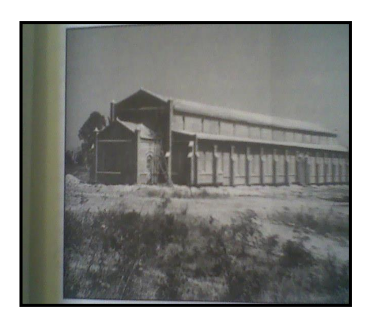
Figure 2: The Lumpa Church at their headquarters at Kasomo in Chinsali.