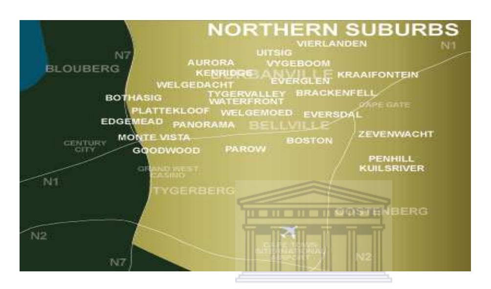
Figure 1: The Northern Suburb

The school began to admit learners of all ethnic groups – Coloureds, Indians, Blacks along with the existing White population.<sup>2</sup>