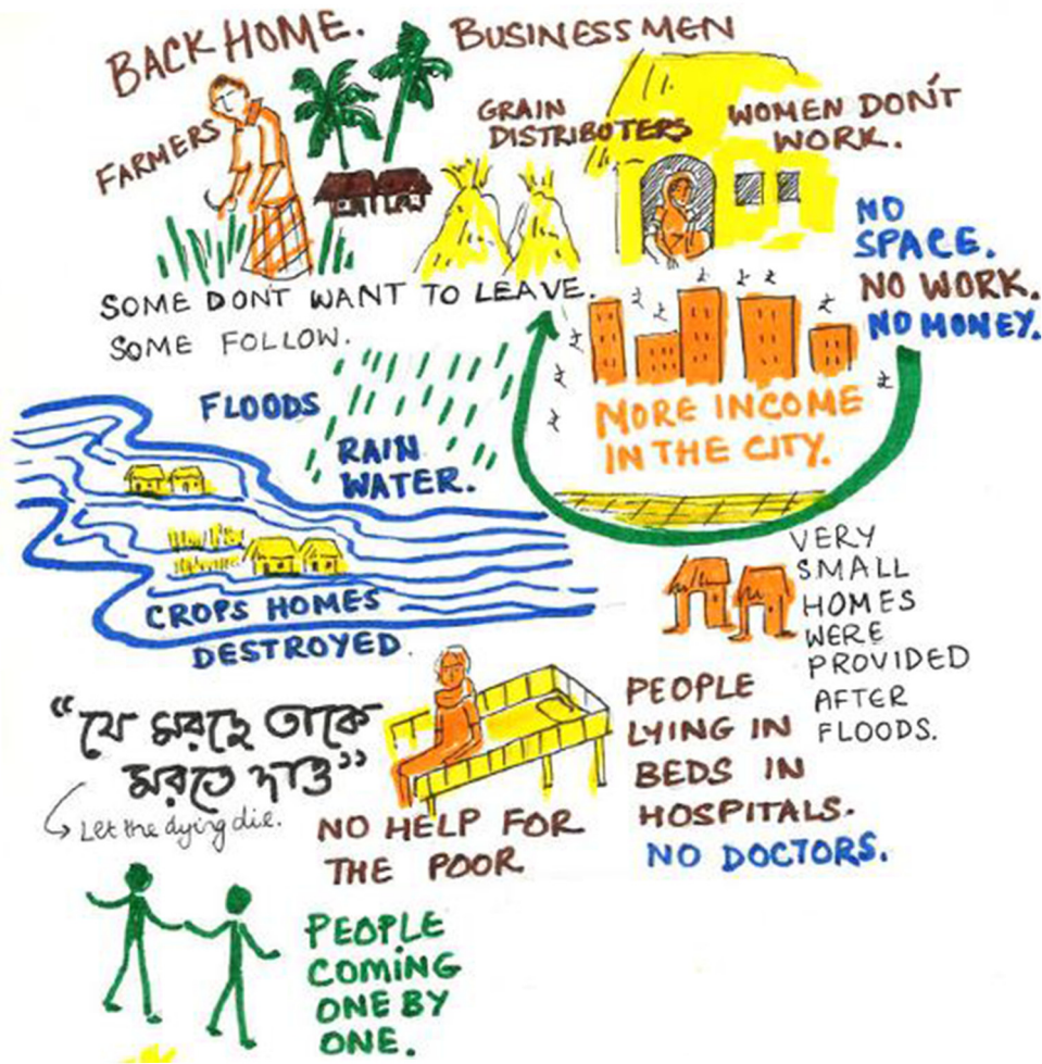
Figure 1. A graphical sketch of the premigration story shared by the migrant workers during a focus group discussion conducted on February 17, 2017.