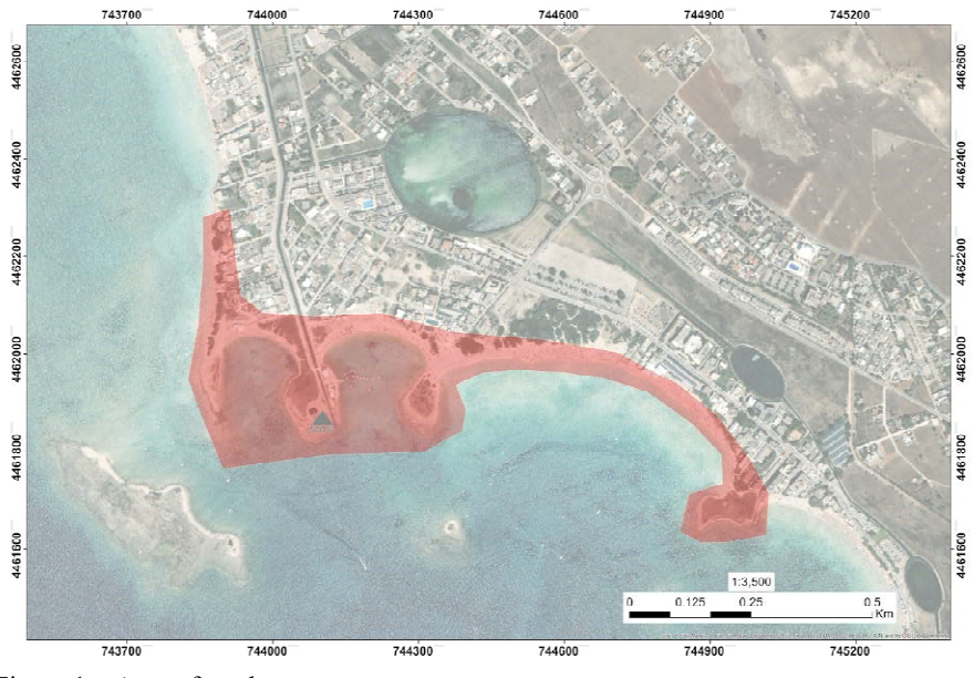
Figure 1 – Area of work.

The working group used an RPAS DJI model Phantom 4 Pro, that allows to cover areas from 25 to 35 hectares in a day and to return a multitude of outputs within a short time, like high-resolution orthomosaic, Digital Elevation Models (DEM), contour lines, habitat mapping (habitat identification is based on broad classes that are easily recognized based on ground truth and image analysis by trained operators. In this case, we focused on discriminating the area covered by beaches, which are easily isolated given the large difference with the urban environment behind.), 3D models and, sections and profiles of the beach. The survey sites were identified in the three pocket beaches located in the central area of the protected marine area "Porto Cesareo", the work area falls within the ideal polygon having vertices with coordinates 40.275400° N 17.868497° E, 40.271928° N 17.882110° E, 40.268685° N 17.880147° E, 40.272608° N 17.866113° E (fig. 1).