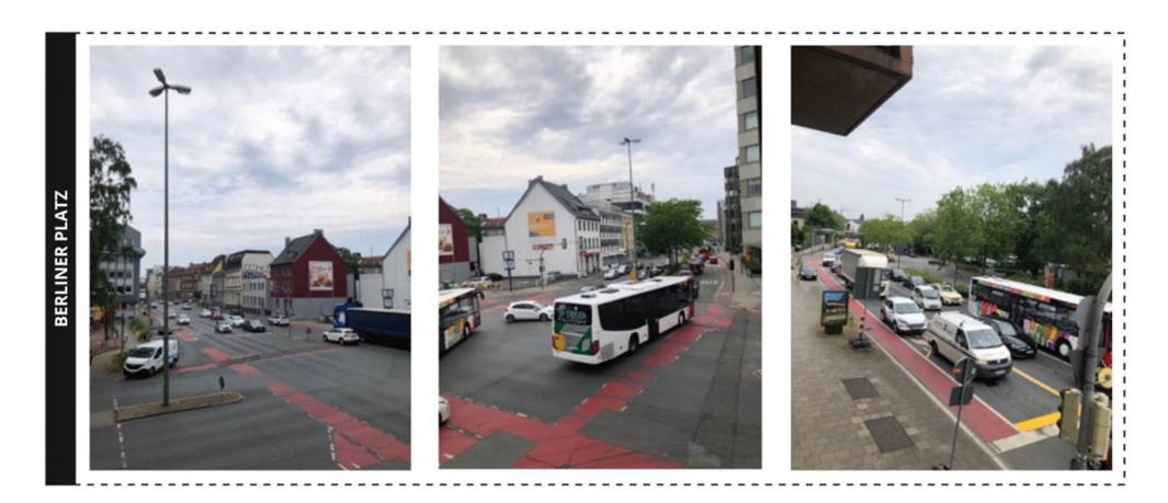
Figure 6. The main intersection of Berliner Platz. (Maximilian Heinke).

In further investigation, the situation and potential stressors at those spots must be observed with camera systems. Surely factors such as time of day and quantity of vehicles must be considered to obtain are more differentiated picture, especially on the effect of streetscapes, especially the design of bicycle infrastructure. Therefore, a comparison of morning or evening peaks at different cycling infrastructures would be favourable. The analysis of the three study areas showed the following results, underlying some early findings of the research conducted concentrating on two major intersections and Katharinenstraße a main bicycle route converted to a 'Fahrradstraße' in 2011 (MARTNS, 2011).