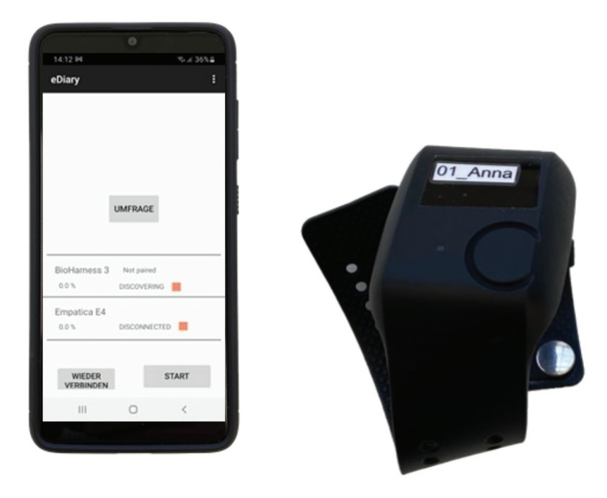
Figure 3. Setting of the EmoCycling data collection: smartphone and Empatica E4 Smartband. (own figure).

method can be compensated for by the addition of another during data collection, analysis, and interpretation. Due to the subjectivity and complexity of the research object, a methodological procedure that reflects these circumstances is required (cf. Chapter 2.3). Figure 4 provides an overview of the methodological approach, showing that the triangulation process was used for data collection (standardized as well as open, sensor data), analysis (spatial and statistical), and interpretation.