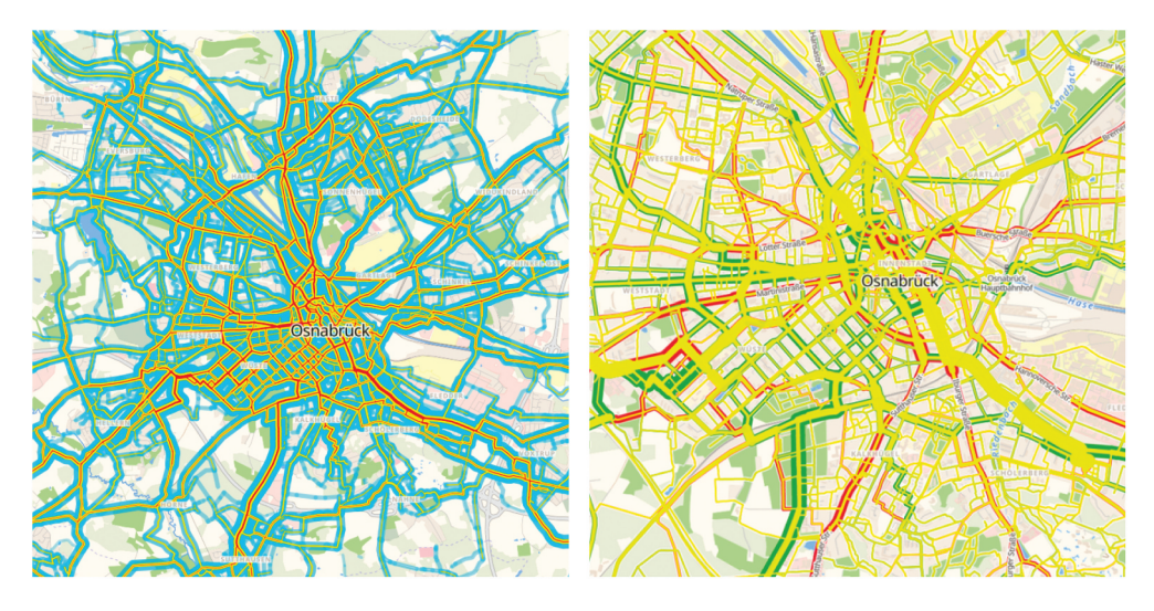
Figure 2. Initial data collection in Osnabrück: main route network (left) and attractions (right). (own figure based on bike Citizens Analytics and OpenStreetMap).

In contrast, many cyclists avoid Martinistraße, which runs parallel to Katharinenstraße in the south with a strong MPT dominance, and Lotter Straße in the north.