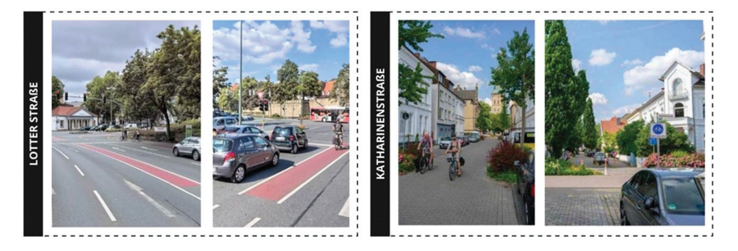
Figure 7. Protected bike lane of Lotter Strasse – Natruper-Tor-Wall (left) and the bicycle street katharinenstraße (right). (Maximilian Heinke).

Katharinenstraße (Figure 5 (3) and Figure 7, right) shows rather interesting findings. The street was redesigned as a bicycle street still allowing motorized traffic but giving cyclist priority. The data shows high amounts of trips using Katharinenstrße on different routes leading from east to west. At the same time, MOS data shows rather high amounts of stress. A closer examination of the street shows a high number of cars parking at a 45-