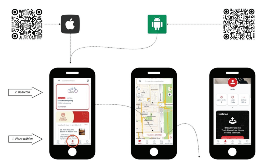
Figure 1. Setting and flow of the initial data collection: bike citizens app. (own figure).

Figure 2 shows the results of this analysis in Osnabrück, referring to ZEILE et al. (2023). In Osnabrück, the intensive use of paths in the city center is a special characteristic. The western areas (especially Katharinenstraße, which is designated as a bicycle lane), as well as the 30 km/h zones in the Wüste district, have a high level of bicycle use.