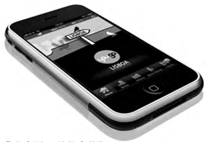
Figure 3 • The YouGo Lisboa guide (YouGo, 2012)

In Portugal, there are also a number of apps in use: the YouGo guides (Leiria-Fátima, Lisboa, Lisboa e Vale do Tejo, Oeiras, Sintra, among other areas: Fig.3), and the Braga Digital, VPorto and VisitAlgarve guides.