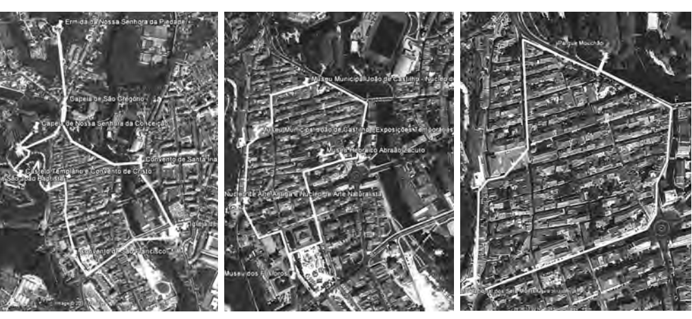
Figure 7 • Monumental Tour (left image), Museum Tour (center image) and Nature Tour (right image) (Marques & Santos, 2012)

The monumental tour includes the Templar Castle and Convent of Christ, the Church of Santa Maria do Olival, the Church of St. John the Baptist's, the Chapel of Nossa Senhora da Conceição, the Chapel of S. Gregório, the Santa Iria Convent, the São Francisco Convent and the Chapel of Nossa Senhora da Piedade. The museum tour includes the João de Castilho Municipal Museum and its three collections: Ancient Art, Naturalistic Art and Contemporary Art, the Museu Hebraico Abraão Zacuto (Abraão Zacuto Jewish Museum) and the Museu dos Fósforos (Matches Museum). The Nature tour includes the Mata Nacional dos Sete Montes and the Parque Mouchão (Fig. 7).