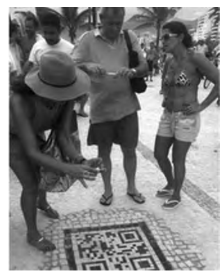
Figure 1 • QR Code in Rio de Janeiro (BBC, 2013)

In Rio de Janeiro, the competent authority for tourism is using QR codes in sidewalk pavements to help tourists to get to know the city better, including the beaches and historic sites (Fig.1).