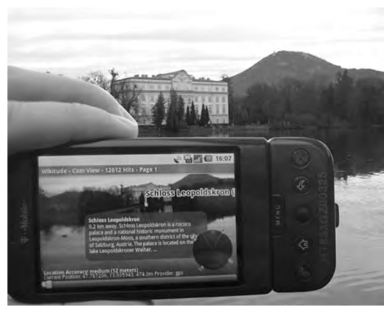
Figure 4 • Wikitude Augmented Reality Travel Guide (Mobilizy, 2009)

The use of augmented reality adds an extra dimension of reality, increasing the interest of tourists in visiting certain locations, helping them choose what to see and making it easier to create their own itineraries (Jesus & Silva, 2009).