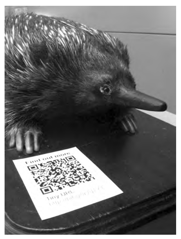
Figure 2 • QR code at the Australian Museum (Cork, 2010)

Audio guides usually are MP3 sound files that can be downloaded from the Internet or specific hotspots using wireless technologies such as bluetooth. Some mobile devices already have the audio guides incorporated.