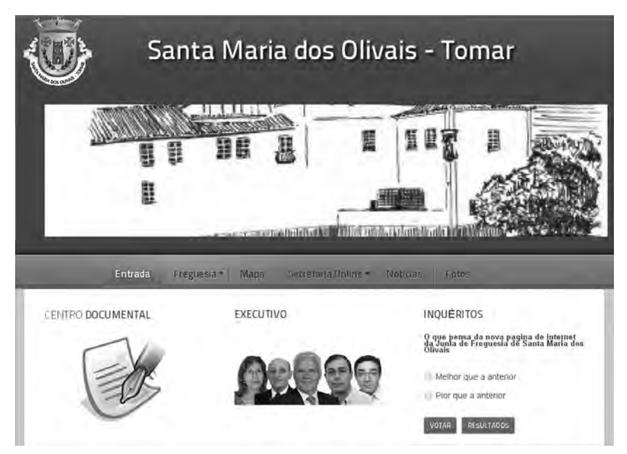
Figure 5 • Website of the Parish Council of Santa Maria dos Olivais – Tomar

A QR code was created for each monument with hyperlink to the website where detailed information will be provided about the monument in question. Pinto (Pinto, 2012) proposed a model for the plaques identifying the monuments where information in Braille will also be added (Fig. 6).