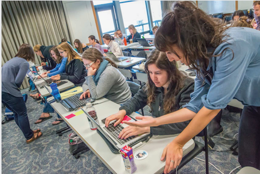
Figure 1. A Software Carpentry Boot Camp for Women at Lawrence Berkeley National Lab.