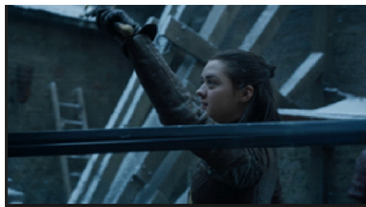
Arya spars with Brienne

To gain insights as to what transpired during an event from social media posts related to the event (and published while the event was airing), it is important to