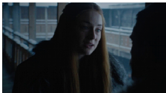
Jon receives a message from kings landing