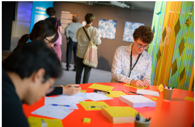
Figure 3. The New Real Pavilion and Research Hub by The New Real 2022 at Ars Electronica, Linz 2022.

minimal freedom to the artist. To enable users to define a 'dimension', two pipelines were developed around the training or fine tuning of a model and subsequent processing of additional information: an 'images' pipeline centered around a generative model; and a 'words' pipeline centered around a word embedding model. A novel 'SLIDER' – Shaping Latent-spaces for Interactive Dimensional Exploration and Rendering – tool was developed as the final stage within each of the pipelines, allowing the artist to probe their model for an output at a specific position in the newly-constructed dimension.