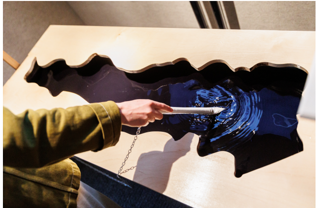
Figure 2. Photographic Cues by Keziah MacNeill 2022 at The New Real Pavilion, Ars Electronica, Linz 2022.