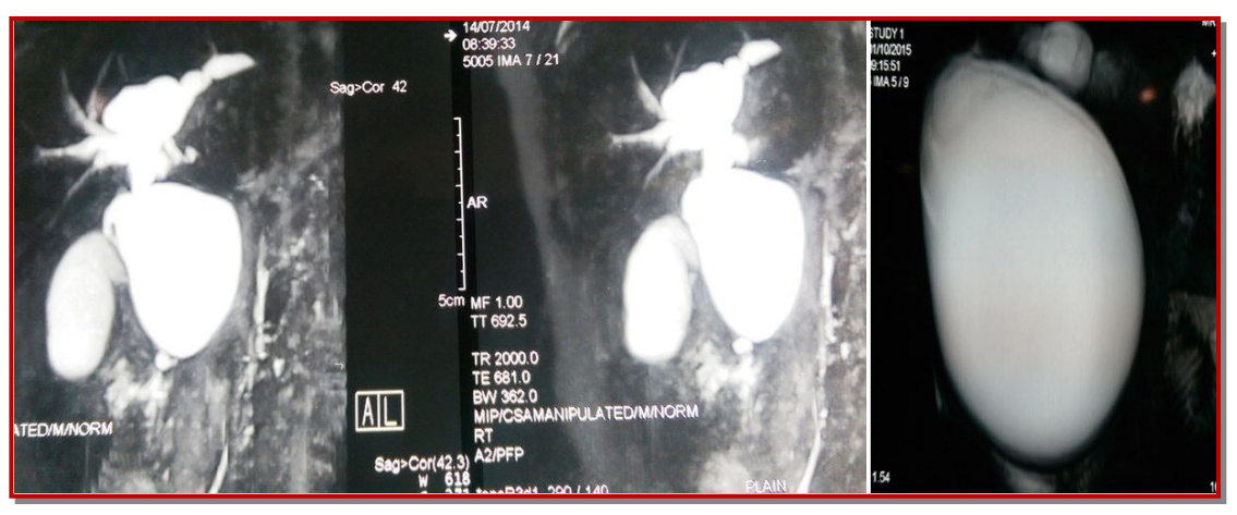
Figure 1: Preoperative evaluation with MRCP (Giant choledochal cyst)