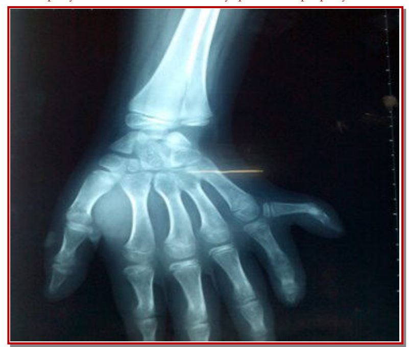
Figure 4: X-ray left hand including wrist joint including hand showing delayed bone age

renal abnormalities. Renal failure is the major cause of morbidity and early mortality in Bardet-Biedl syndrome and 25% die by the age of 44 years. Renal function was found to be normal in our patient.