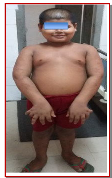
polydactyly upper limb

atorvastatin and oral antidiabetic drug. Regular CBG monitoring was advised.