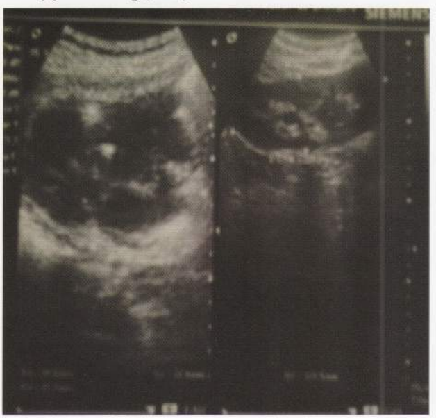
Fig-2: Ultrasonography of KUB region reveals multiple hyperechoic structures within the right renal parenchyma

Fig-2: To 99m -DTPA renal scintigraphy with dynamic acquisition of sequential images revealed an increase in the time of collecting of the tracer and a delay of excretion indicating severe obstructive uropathy with poor right kidney functioning (25%)