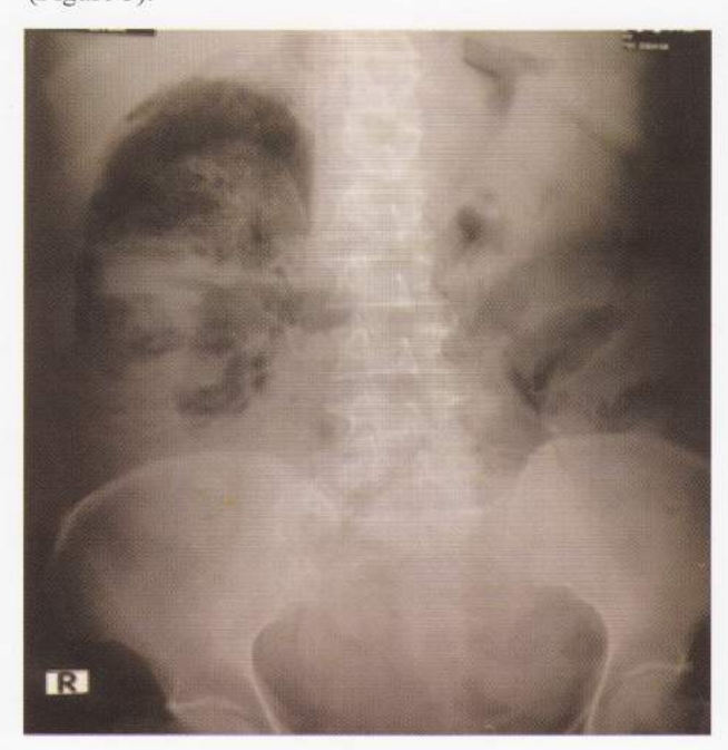
Fig-1: Plain X-ray Abdomen shows presence of air in the right renal topography

Her Roentgenogram of KUB showed large negative shadow of air around the region of right kidney (Figure 1) which suggested emphysematous type of pyelonephritis. The sonography of the abdomen revealed the right kidney is grossly enlarged in size and shape and with total loss of cortico-medullary differentiation associated with multiple highly echogenic structure which strongly reflected as gas bubbles impacted in the renal parenchyma compatible with the diagnosis of emphysematous pyelonephritis of right kidney (Figure 2). In the following hours the patient slowly deteriorated and became hemodynamically unstable. After initial resuscitation, isotope renogram (Tc-99m DTPA) was done which showed severe obstructive uropathy in right kidney with poor functional status (25%) (Figure 3).