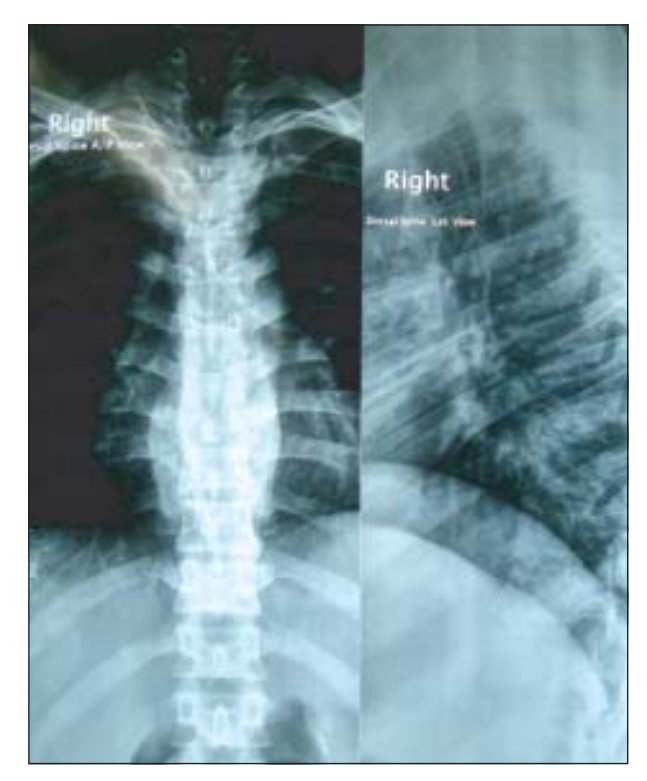
Fig.-1: X-ray chest& dorsal spine showed para-vertebral abscess

continued. As her condition gradually improved and after removal of her chest drain she was discharged on 8<sup>th</sup> post operative day with 18 months of antitubercular chemotheraphy. After 18 months of follow-up she was able to walk independently and radiologically her spine was much better.