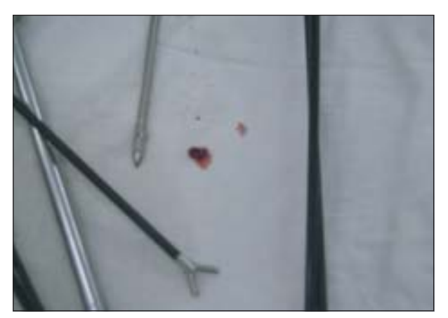
Fig-4: Biopsy taken from the abscess wall.

Under general anaesthesia the patient was placed on right lateral position with left lung collapse (Single Lung Ventilation). The monitor was placed at the back of the patient near the shoulder with surgeon and the camera assistant on the front side of the patient. Three ports were used. One 10mm port was in the right anterior axillary line at the 5<sup>th</sup> intercostal space for the telescope and two 5mm