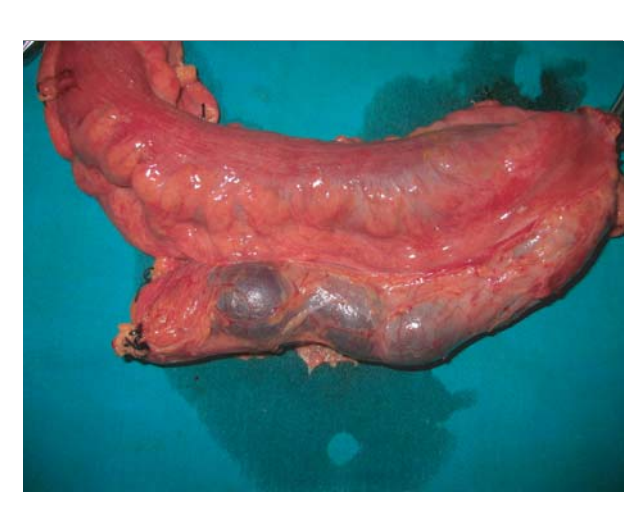
Fig.-2: Engorged veins in mesorectum

A female patient of 20 years presented with similar features like that of first case. She also had several units of blood transfusion. She under went haemorrhoidectomy 3 years back. Clinical examination revealed moderate anaemia. Abdominal examination was normal. Digital rectal examination revealed fresh blood, spongy rectal mucosa. Colonoscopy revealed thick, edematous bluish discolored rectal mucosa extending from dentate line up to 30cm. After preparation of the patient, laparotomy was done. Rectum and sigmoid colon was found thickened with engorged vein on the surface. Inferior mesenteric vein was hugely dilated (Fig. 2) involving rectum and lower part of the sigmoid colon. The involved gut was excised along with mesorectum. Gut continuity was established with hand sewn coloanal anastomosis with a covering ileostomy. Post operative recovery was uneventful.