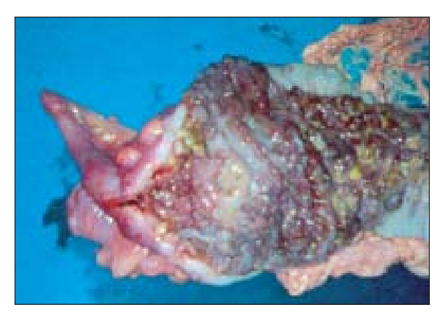
Fig. -1: Part of the right hemicolectomy specimen showing cavernous haemangioma of caeum and ascending colon