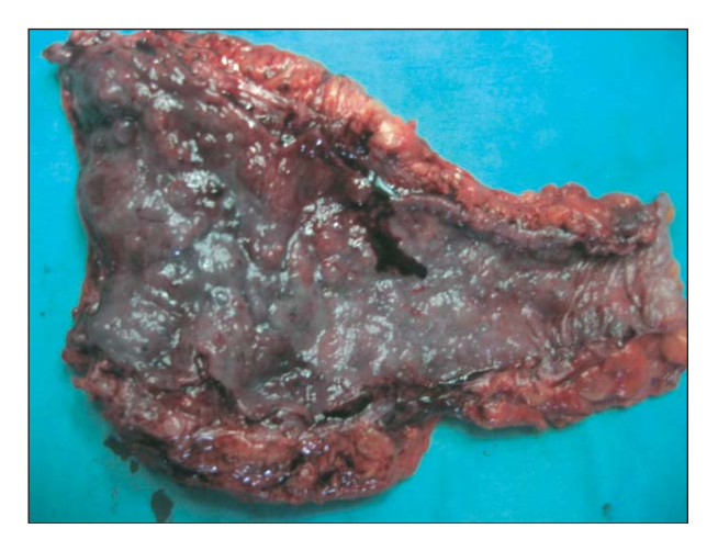
Fig.-5: Engorged mucosa with dilated vessels.

Dilated engorged veins and bluish discoloration of the mucosa were found in all cases (figure no. 5). All these patients were followed up from one month to four and half years. All maintained good health with no further attack of rectal bleeding.