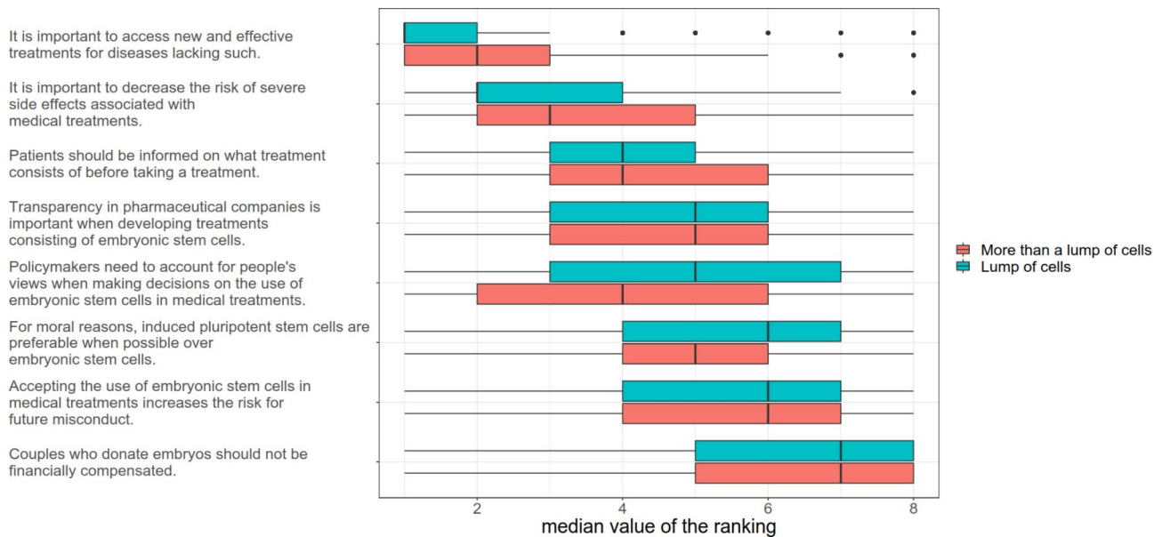
Fig. 2 Attitudes of patients with PD. Bars indicate the values of the ranking of the statements on the left. Color bars in red and green dichotomize the participants' view of a non-implanted embryo as a lump of cells. The dots indicate outliers, and the horizontal lines reveal the variability outside the upper and lower quartiles

calculated for the group who would consider potential new treatments for PD (Table 4).