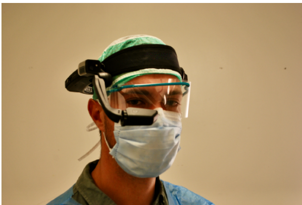
FIGURE 2. An example of a combat medic wearing the RealWear HMT-1Z1.

riculum. This curriculum was based on the core principles of microteaching and consisted of instructions on the basic anatomy of the lower leg, indications for a fasciotomy, and surgical techniques for performing a fasciotomy. The lecture also included details and instructions for the use of the HMD. The study was conducted in three 30-min time blocks, with three combat medics per time block. After a short setup period of 5 min, the combat medics performed a fasciotomy on an AnubiFiX ® -embalmed postmortem human leg 18,19 in the operating room (OR), which is based in the Skillslab & Simulation Center.