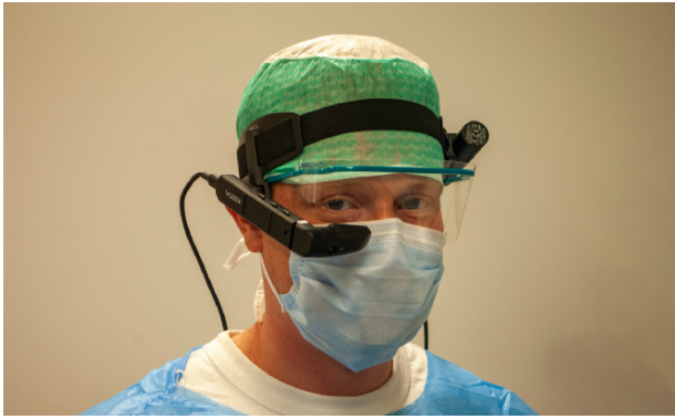
FIGURE 1. An example of a combat medic wearing the Vuzix M400.