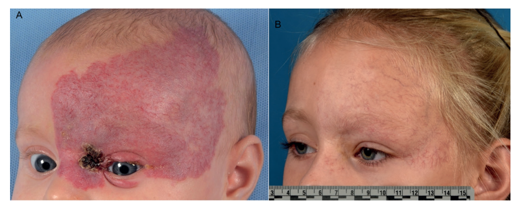
Fig. 1. Photographs of the infantile haemangioma before beta-blocker treatment initiation and at follow-up. (A) Female with a large (>50 mm) ulcerated superficial and segmental infantile haemangioma located on the head, before initiation of beta-blocker treatment (propranolol) at the age of 3 months. (B) The residual lesion was scored during the follow-up visit, when the child was 6 years old. The paediatric dermatologist gave an Observer Scar Assessment Scale score of 5, parents gave a Patient Scar Assessment Scale score of 4, and the child gave a visual analogue scale score of 2. The paediatric dermatologist also determined that telangiectasia were present, and that fibrofatty tissue and atrophic scar tissue were absent. Both parents gave written permission to publish these photographs.

Patient records of children born between 2008 and 2014 (age \geq 6 years upon participation in the study) and treated for IH with beta-blockers at Erasmus MC or UMCU were screened for participation. Eligible children had been treated for IH with either oral propranolol (dose \geq 2 \text{ mg/kg/day} ) or oral atenolol (dose \geq 1 \text{ mg/kg/day} ); had a treatment duration of \geq 6 months; and were \leq 1 year old at initiation of beta-blocker treatment. Those children were invited to participate. Children who had received treatment for