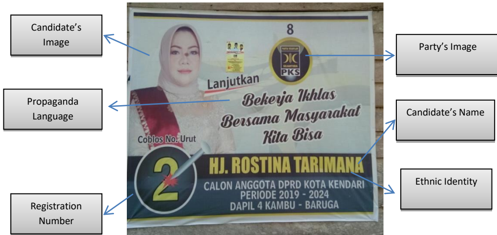
Figur Billboard Content of a Legislative Candidate Justice and Prosperity Party of Kendari City