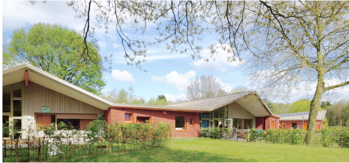
Figure 1: VIC viewed from the street

Ethical clearance: The Social and Societal Ethics Committee of KU Leuven granted approval for this study (No. G- 2018 02 1116). Moreover, the management of the studied care organization has approved the study; the collaboration has been formalized and the use of the RCD has also been formally approved. Finally, the research is also supported by ZonMw (No. 8450006107) and respects prevailing ethical conditions.