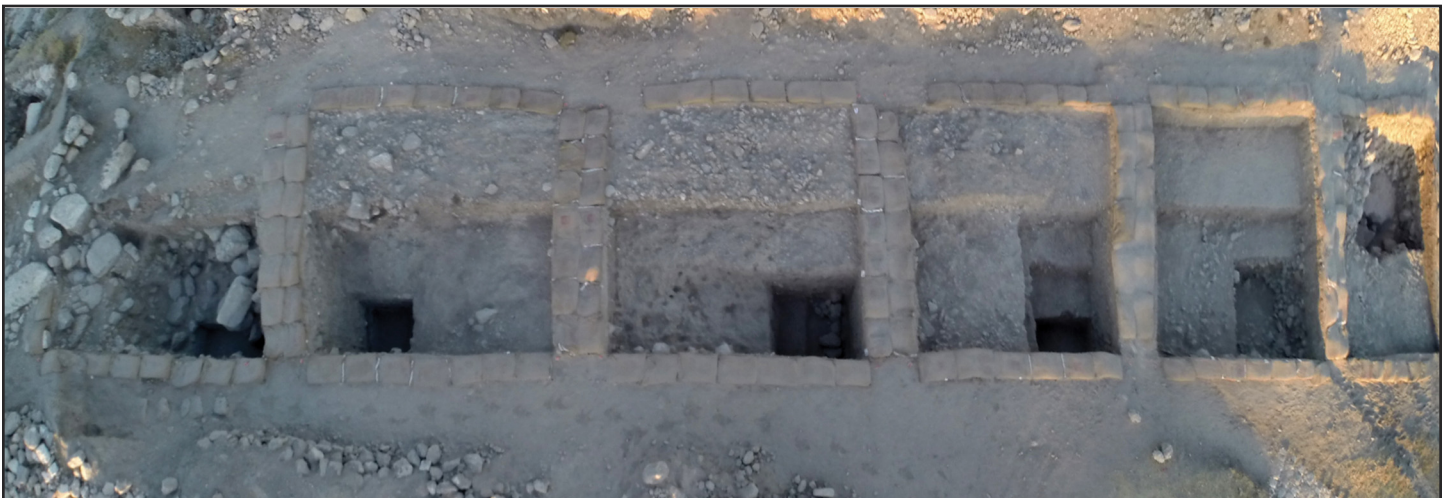
Field J Step Trench.

It was revealed that the anomaly in Square 4N93 was a naturally-occurring fissure in the bedrock, likely from an earthquake. The seismic event would probably have preceded the Early Bronze Age activity in this immediate area, as a plaster surface dated to this time had been laid directly into the crevice in the northern end of the square. This surface and a series of four evenly-spaced postholes may be related to a similar plaster surface laid in the south end of the square on the lower bedrock shelf, also dating also to the Early Bronze Age. This second surface was accompanied by six evenly-spaced postholes on the edge of the upper