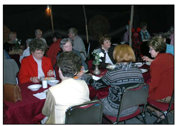
Antiquarian Society Luncheon and Bedouin Tent.