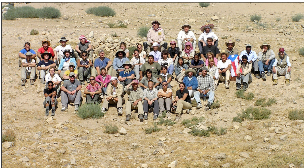
Jalul 2007 Team.