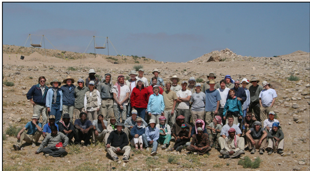
Jalul Team from the 2005 Season.