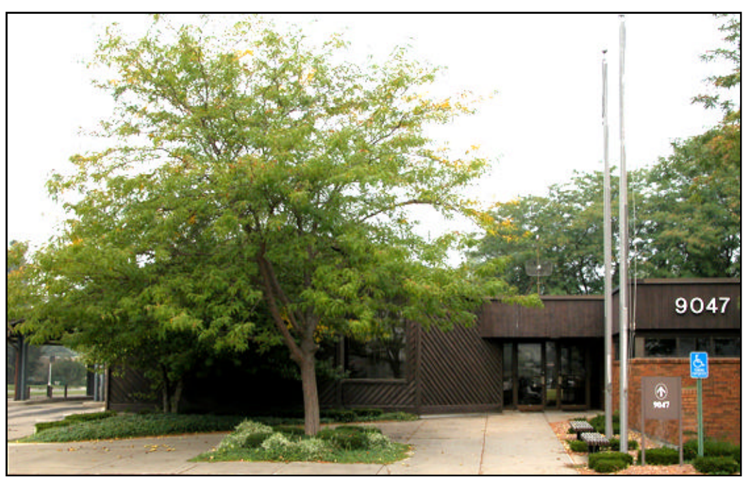
Future home of the Institute of Archaeology/Horn Archaeological Museum.

The original location of the Museum, beginning in 1970, was on the ground floor of the James White Library. It, along with the newly founded Institute of Archaeology, moved to its current location in 1982. Although this facility, across from the Seventh-day Adventist Theological Seminary, has featured a compelling exhibit covering an entire floor of the building, the remainder of the space, which consists of offices and an archaeological library, did not provide for storage and laboratory space. As a result, researchers and students had to make use of temporary facilities housed in other buildings on campus. In addition, the current building was built earlier last century and no longer functions economically in terms of such infrastructure items as electricity and heating. As a result it has been slated for destruction as soon as a new facility was available. When it became apparent that the vacated bank building had remained empty for an extended period of time, Drs. Younker and Merling approached the University Administration about acquiring it as the continued on p. 2