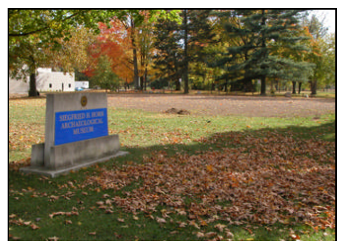
Empty field where the Museum once stood.