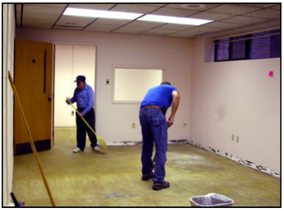
Workers prepare floor in the pottery lab.