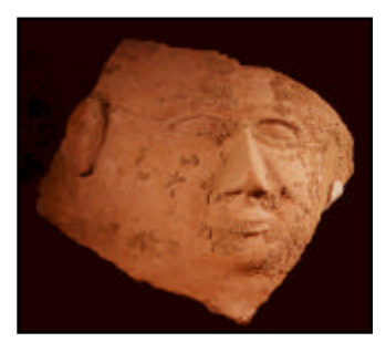
Philistine Coffin Mask Iron Age |