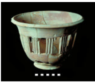
Fenestrated Bowel Early Roman Period