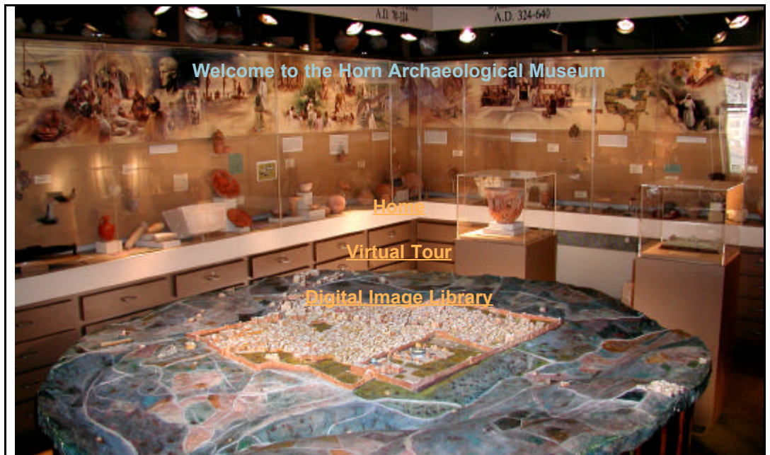
The Virtual Tour and Digital Image Library of the Horn Archaeological Museum Webpage.