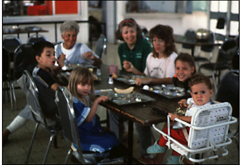
A leisurely meal at camp