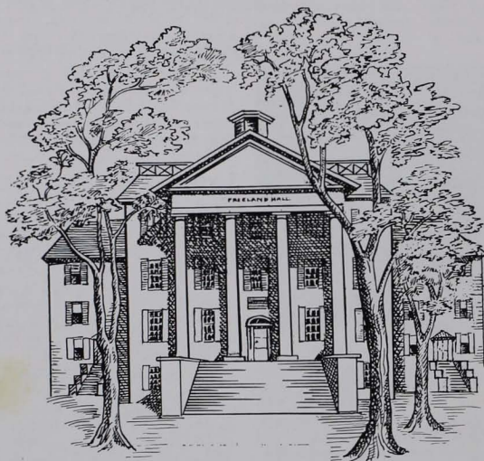
Freeland Hall Ursinus College