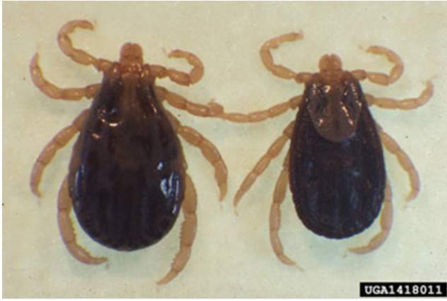
Figure 4: Winter Tick ( Dermacentor albipictus ) female (L) male (R).

body color. The American dog tick is a three-host tick. The adults sometimes infest large animals including horses and cattle, but are seldom serious pests of these animals. The adults often feed on humans, and they are a serious pest in high-use wooded recreational areas. The larvae and nymphs feed on small rodents (e.g. mice, rats and rabbits).