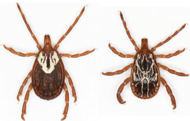
Figure 8: Gulf Coast Tick ( Amblyomma maculatum) female (L) male (R).

Rocky Mountain spotted fever (RMSF), the most important tick-borne disease in Oklahoma, is caused by the intracellular bacteria, Rickettsia rickettsii , which is transmitted during tick feeding. Although this was first found in the Rocky Mountains, it is now mostly found in the south-Atlantic region, Pacific region, and west south-central region. Oklahoma and North Carolina have the highest incidence of the disease, accounting for more than a third of the cases annually. Most cases of RMSF in Oklahoma occur between April and September, with the peak number of cases in May, June and July. The American dog tick ( Dermacentor variabilis ) is the major tick that transmits RMSF,