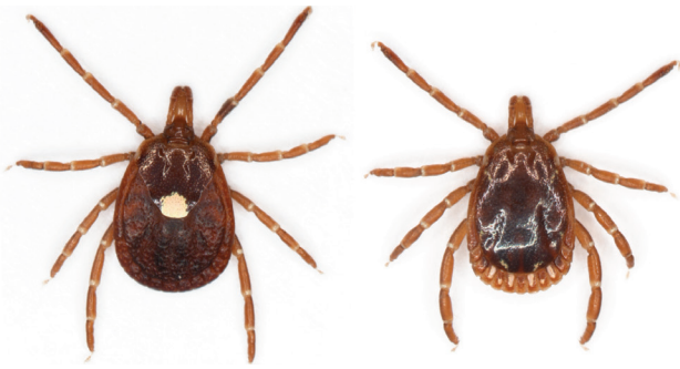
Figure 7: Lone Star Tick ( Amblyomma americanum) female (L) male (R).

coyotes and humans can be parasitized. This tick has become increasingly abundant in Oklahoma in the past 20 years and is an important pest of cattle. It transmits Hepatozoon americanum to dogs and coyotes and possibly Rickettsia parkerit to humans. The adults attach to the ears of cattle and are most abundant in early April to mid-June. When infestations are high on cattle, the ears may become thickened and curled causing a condition called “gotch ear.” This tick reportedly has produced tick paralysis in humans and dogs.