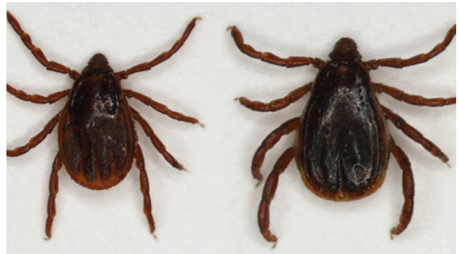
Figure 6: Brown Dog Tick ( Rhipicephalus sanguineus ) female (L) male (R).

The tick receives its name for the large white spot on the dorsal shield of the female. The male has white markings around its posterior margin. This species has longer mouthparts than