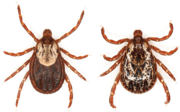
Figure 5: American Dog Tick ( Dermacentor variabilis ) female (L) male (R).

The brown dog tick (Figure 6) is probably the most widely distributed tick species in the world and is very common in Oklahoma. Dogs are the primary host, but when dogs and their bedding places are in close association with humans, bites to