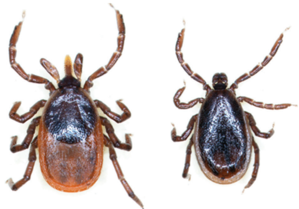
Figure 3: Deertick or Black-legged tick ( Ixodes scapularis ) female (L) male (R).

The American dog tick (Figure 5) is a common pest of dogs and other small, wild or domestic animals, which are the preferred hosts for the adults of this species. This is a colorful species, having spots of light colors (white, gray, silver) scattered and superimposed over the basic brown and black