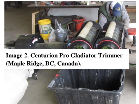
Image 2. Centurion Pro Gladiator Trimmer (Maple Ridge, BC, Canada).

Autoflower varieties are included for comparison with full season plants in the variety trial. Each was evaluated using similar metrics and received similar field preparation to those grown within the variety trial. Spacing for autoflower varieties was reduced to 2’ and were similarly planted into irrigated black plastic. Autoflower varieties ‘Auto Ceiba,’ ‘Early Bird 1,’ and ‘Early Bird 2’ are included for comparison, but were not included for statistical comparison due to unique growth habit.