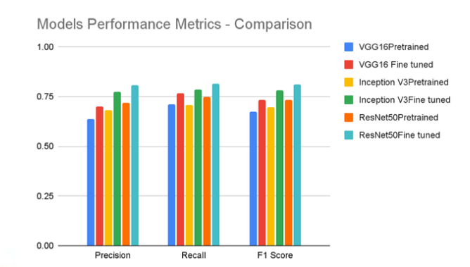
Figure 3. performance metric of different models