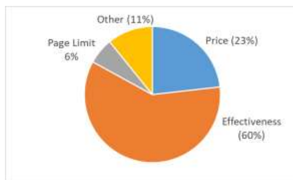
(Figure 2: Factors Affecting Selection of Plagiarism Software)

Analysis of hypothesis-4 suggested that the factors affecting the choice of plagiarism detection software are independent of educational-qualification and professional-category. Its corresponding descriptive analysis is presented in Figure 2.