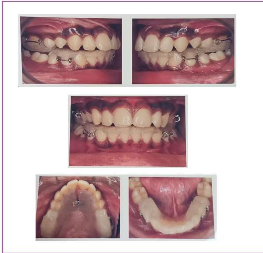
Figure 3. Intra-oral Photographs of appliance in vivo