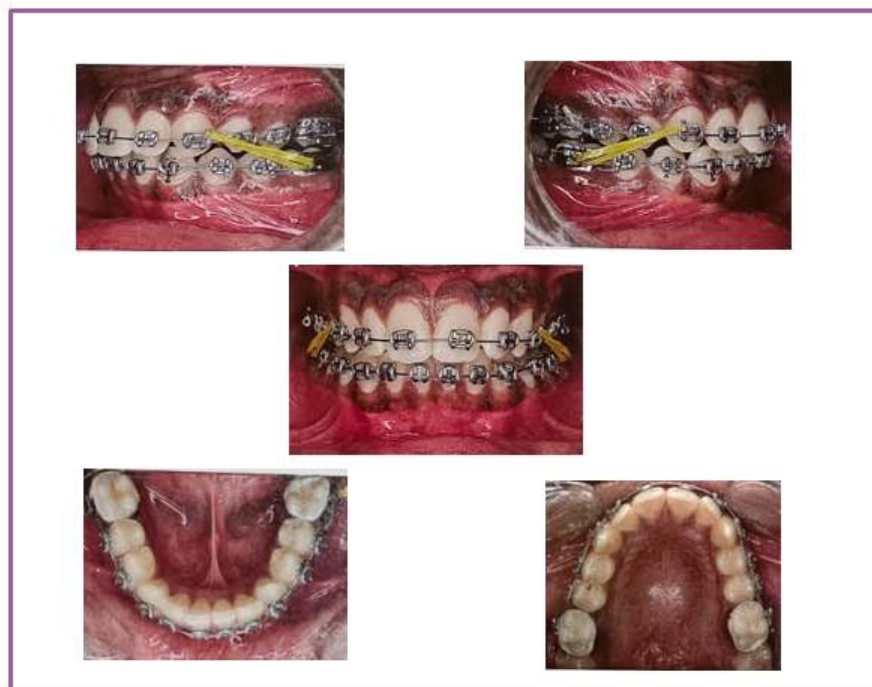
Figure 5. Fixed Orthodontic Therapy followed after Functional Therapy (Intr-Oral photographs).