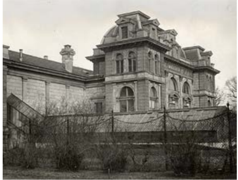
The former building of the Institute for Experimental Biology with the Prater Hauptallee in Vienna. Today a memorial plaque on this site commemorates the institute. The building was destroyed by incendiary bombs on 11 April 1945, during the last days of the war in Austria.