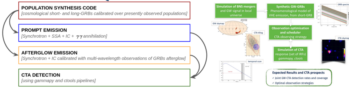
Figure 2: (Left:) Scheme of the GRB consortium publication work. Synthetic spectra and light curves are obtained by a population synthesis code and used to feed the CTA analysis pipeline. (Right:) Workflow for the GW consortium publication. After the simulation of BNS merger, a phenomenological (short) GRB is associated to it. The optimal pointing strategy is then obtained by a dedicated algorithm in order to cover efficiently the sky area of the GW source. Each pointing is then analyzed by means of the CTA analysis pipeline.

Such an approach is based on the POpulation Synthesis Theory Integrated code for Very high energy Emission (POSyTIVE) population model for GRBs [8]. The resulting population is built by considering few intrinsic properties and assumptions: