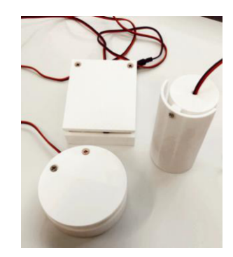
Figure 1. Low-Cost Switches created by workgroup 1