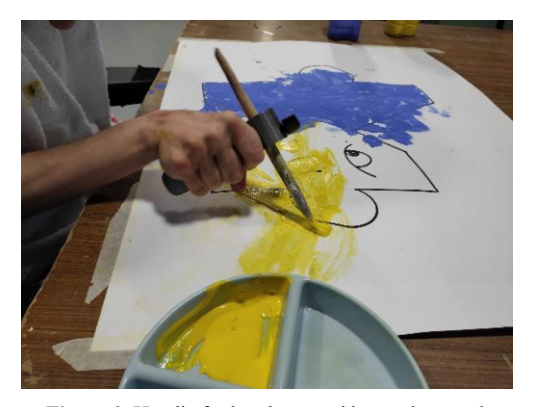
Figure 3. Handle for brush created by workgroup 3