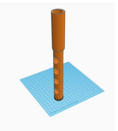
Figure 4. Design of ergonomic handle for comb created by workgroup 4