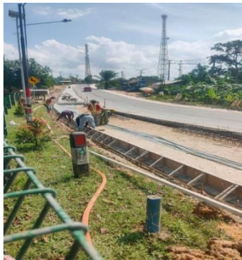
Picture 8. Plastic Placement on Dowels and Tie Bars

If the capacity of the concrete truck mixer is 6 m 3 , then it will require approximately 18 concrete truck mixers. The installation of plastic on dowels and tie bars can be seen in the picture 8 below.