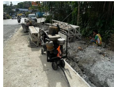
Picture 9. Grooving Tool for Concrete

This work creates a non-slip surface (macrotexture) on the concrete by creating transverse grooves. The tool used to create these transverse grooves is a grooving tool as can be seen in Picture 9.