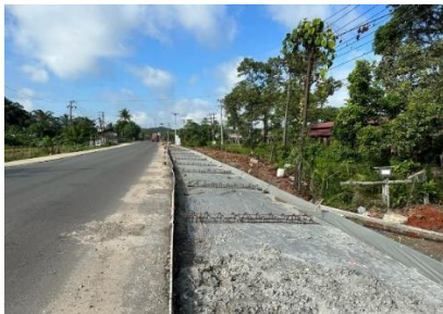
Picture 6. Installation of plastic sheet

A plastic sheet can serve as a working surface for pouring concrete in contact with the ground. Its function is to prevent the leakage of cement-water mix into the soil. Plastic is considered an innovation, replacing the previous materials used for the working surface, such as low-quality screed or concrete. Of course, there are advantages and disadvantages associated with using plastic. It's important to consider the potential benefits while ensuring that it aligns well with the specific project condition. As depicted in Picture 6.