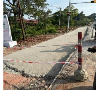
Picture 7 Lean Concrete Floor

If the capacity of the concrete truck mixer is 6 m 3 , then it will require approximately 10 concrete truck mixers.