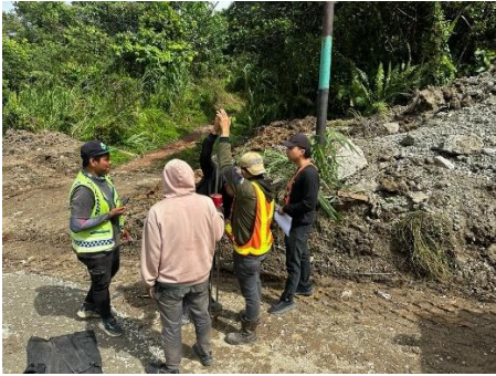
Picture 3. Soil density testing using DCP (Dynamic Cone Penetrometer)