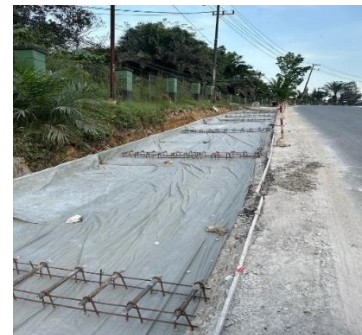
Picture 5. Installation of Formwork

Formwork, also known as shuttering or moulds, is a temporary structure that holds the concrete in place while it is poured and shaped according to the desired form. Formwork must be erected with sufficient strength and an adequate safety factor to withstand or support all live and dead loads without collapsing or posing risks to workers and the concrete structure. A formwork is a tool that assists in shaping the concrete structure according to the planned dimensions, shape, appearance, or position. The formwork itself refers to the portion of the shuttering that functions as a mold for creating the desired concrete shape or the part that comes into direct contact with the concrete. In this project, formwork is made from plywood moulds. As can be seen in Picture 5.