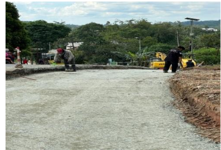
Picture 4. Spreading and Compaction of Class A Aggregate

3. Job spreading and compaction aggregate class A The spreading and compaction of Class A aggregates as depicted in Picture 4 is a requirement for constructing a road shoulder using rigid pavement. Aggregates serve as a supporting layer for the road side body and a load distributor from the top, transmitting it downward through the soil layers. The stages of implementing the foundation layer of Class A aggregate are as follows: