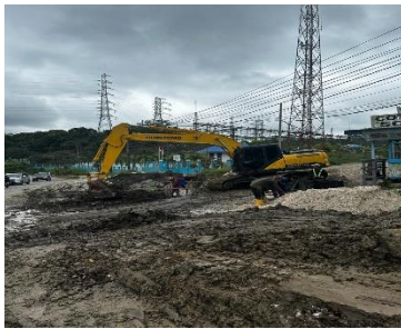
Picture 2. Excavator

Tool mobilization Mobilization of equipment is carried out to ensure no obstacles during the field implementation work. The equipment mobilized for the road side work includes an excavator, dump truck, vibration roller, truck mixer, grooving equipment, dynamic cone penetrometer, and sand cone. As can be seen in the Picture 2.