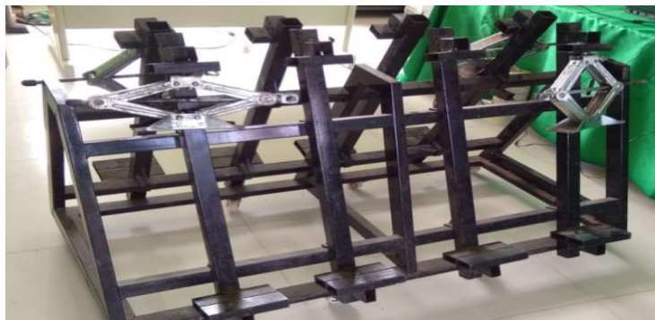
Figure 4. Finished output A Frame Wood Lamination for Instruction