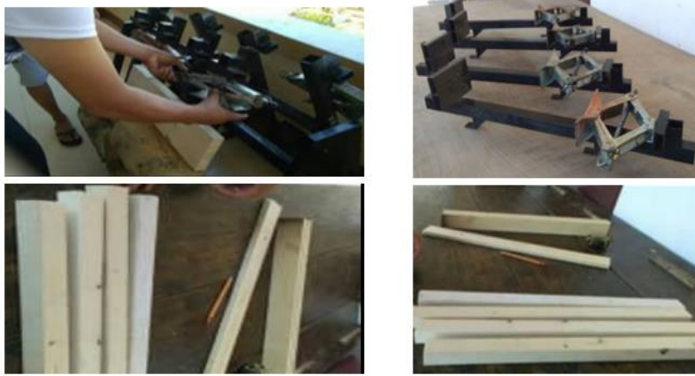
Figure 3. Fabrication A-Frame Wood Lamination