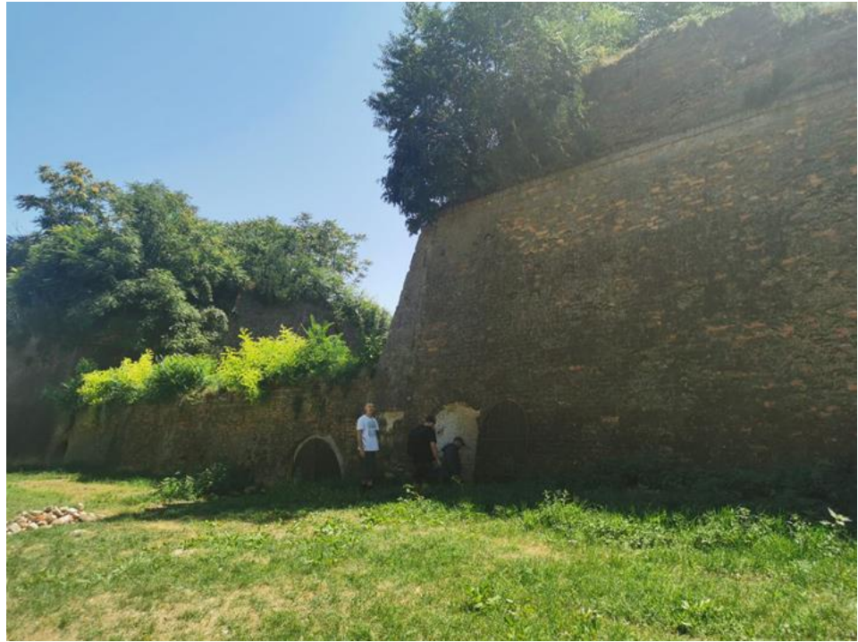
Figure 8. Entrance or Exit; Source: Tatjana Pivac, August 2021.

underground and risk their safety. De Gregorio [97] sees the absence of adequate security for the protection of historical attractions at the destination. This represents a problem even in more popular tourist localities. One respondent was categorical when he said that ‘the lack of care can be felt and as long as that is the case there is no point in talking about sustainability’.