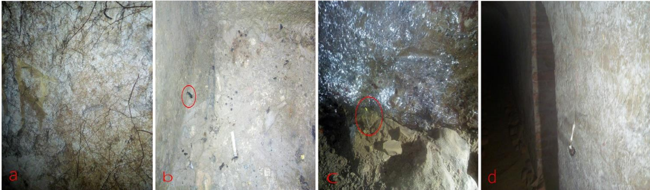
Figure 5. (a) Plant roots; (b) Insect; (c) Condensed water and snowdrop in August; and (d) Mushroom; Source: Tamara Lukić, August 2021.

nearby settlements, such as Sremski Karlovci, Sremska Kamenica, and Ledinci. They think that, with the help of competent institutions and serious machinery, they could be cleaned. The theory that there are tunnels under the Danube leading to Novi Sad was confirmed. One was used as a pumping station for the water supply of the Fortress, and the other served to deliver sewage downstream.