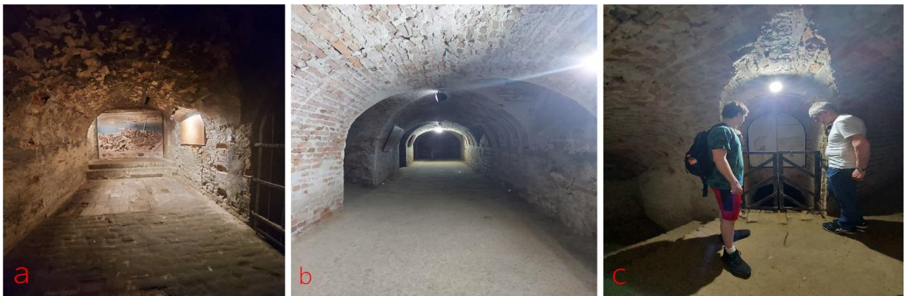
Figure 6. The City Museum of Novi Sad; (a) Illustrated map; (b) The main communication galleries; and (c) Elevator; Source: Jovana Miljković, April 2021.

The ravelin is the object that protects the Emperor Leopold 1 gate. At the top of the ravelin is a communication junction with a two-story elevation. You can see a wall, an obstacle, with internal rifle embrasures. In the second caponier, which is reached by a staircase, there are two large fireplaces in which food was made and a fire was kept. In the niches, there are panels with illustrations of the uniforms of soldiers of the Habsburg monarchy. Then, the Contragard of St. Innocent's Bastion with rifle embrasures is shown. At the end is one side hallway, flanked, for side fire. There are statues with four soldiers in a shooting combat position, in uniforms from the second half of the 18th century. At the top of the bastion is an elevator that descends three levels underground (Figure 6c Elevator). Next to the elevator, at the top of the counter guard, there is a communication junction with two corridors. Through the corridor of the counter-escarpment wall, you exit the underground route and enter the trench space in front of St. Innocent's bastion.