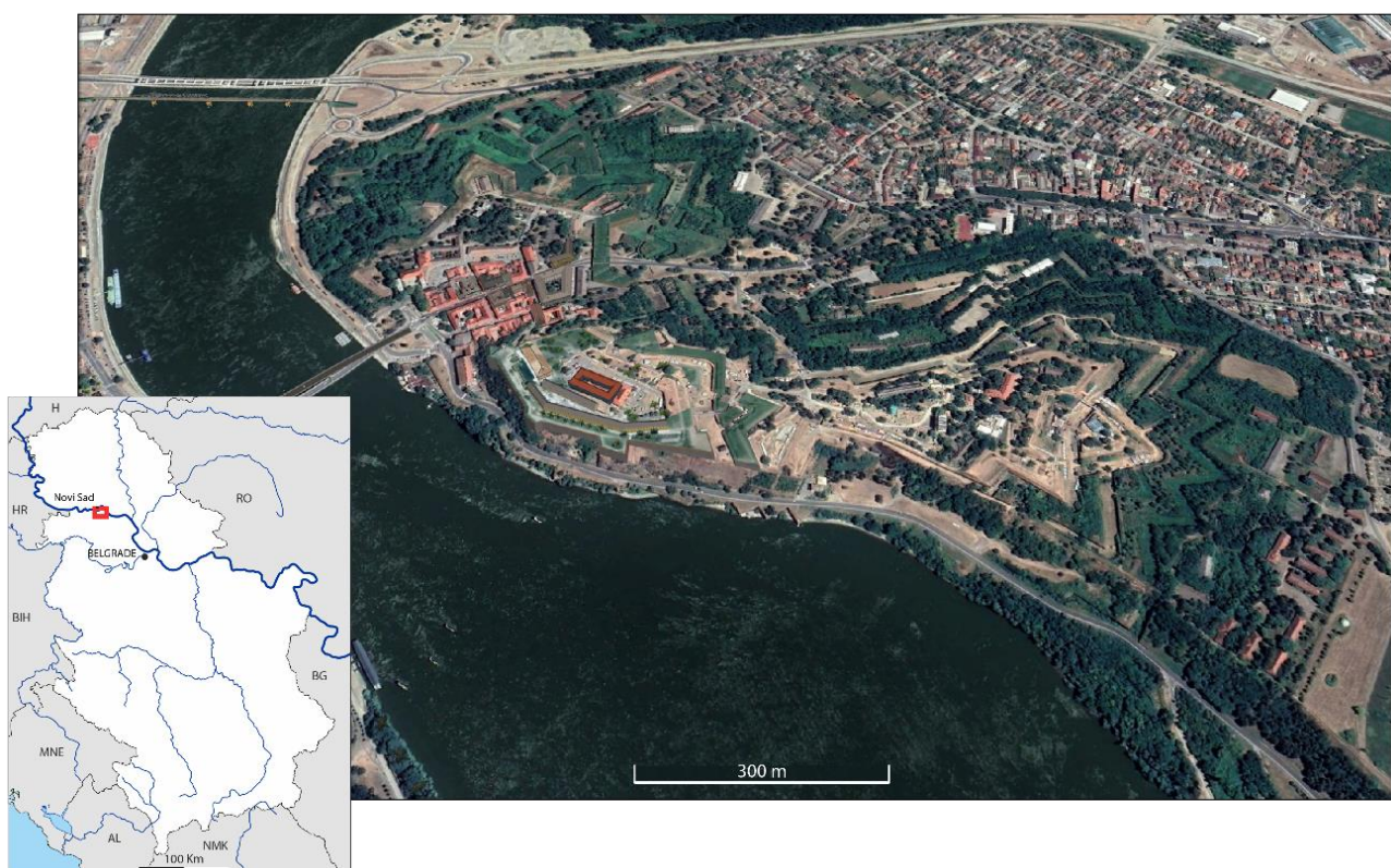
Figure 1. Geographic position of the Petrovaradin Fortress in Serbia. Source: Google Earth; https://d-maps.com/ (accessed on 14 August 2021).

intersected by veins of chrysotile, asbestos, and other secondary materials. They are very crushed and broken. Diabase is a volcanic rock. It is more resistant than serpentinite. Djogo et al. [24], were evaluating the engineering geological conditions for constructing a bridge and a tunnel in the zone of the old Petrovaradin Fortress. They concluded that various sub-surface structures (galleries, corridors, and vertical shafts) are not in the zone which would be affected by settlement of the rocks over the tunnel. A detailed study of geo hazards on the Fruška Gora Mountain made by Mészáros [27], did not mark the Petrovaradin Fortress as an erosion vulnerable location. Finally, Marković et al. [25], concluded that the relative environmental stability identified in the investigated area during the last glacial period is also likely a key factor in human occupation. Erosional destruction of the bank of the Danube River is not one of the potential long-term threats to the fortress. Therefore, the anti-erosion protection of the riverbank under the walls of the fortress is not in reconsideration.