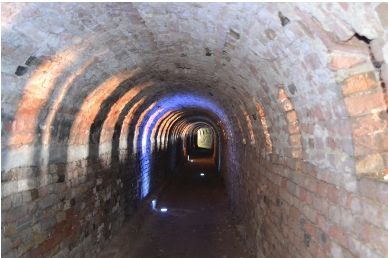
Figure 2. The several hundred metre-long main defence line. The daylight only passed through the embrasures.

It is assumed that the light was rarely used, as it would give away the position of a soldier. Daylight only passes through the rifle embrasures (Figure 2). A length of 16 km has been officially measured, but it is assumed that there is more. When the number of rifle embrasures is multiplied by the 1 m distance between them, added to the fact that there is an underground that is buried and has no direct contact with the surface, thus containing no rifle embrasures, then this assumption is confirmed.