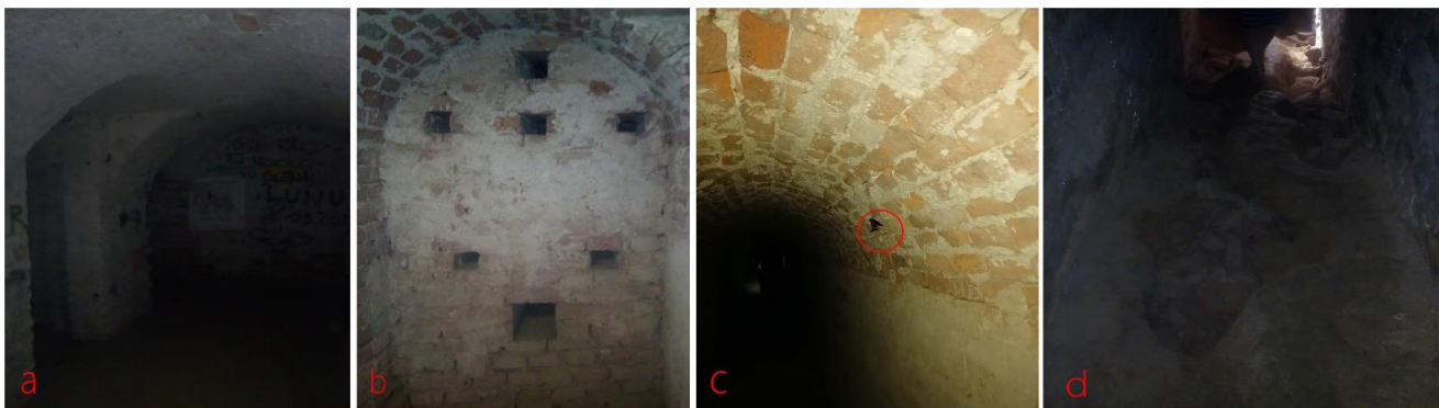
Figure 4. (a) Devastated walls; (b) Inner embrasures; (c) Bat; and (d) Holes in the floor. Source: Tamara Lukić (a,b,d) and Tatjana Pivac (c), August 2021.

Milković [46] discovered the regularity of intersections in the 1960s, which reduces the danger of losing orientation. Therefore, the correct interpretation still makes them useful today. Šeguljev [52] writes that, over time, other signposts appeared, for example boards from 1905 in colours (green, red, blue, and black), metal, plaster, and concrete [53]. For decades, visitors to the underworld have left various marks on its walls in an attempt to move through it without the help of a guide service. That is why today the walls of the underground often look ugly, untidy, and streaked, i.e., its ambient values are disturbed (Figure 4a Devastated walls).