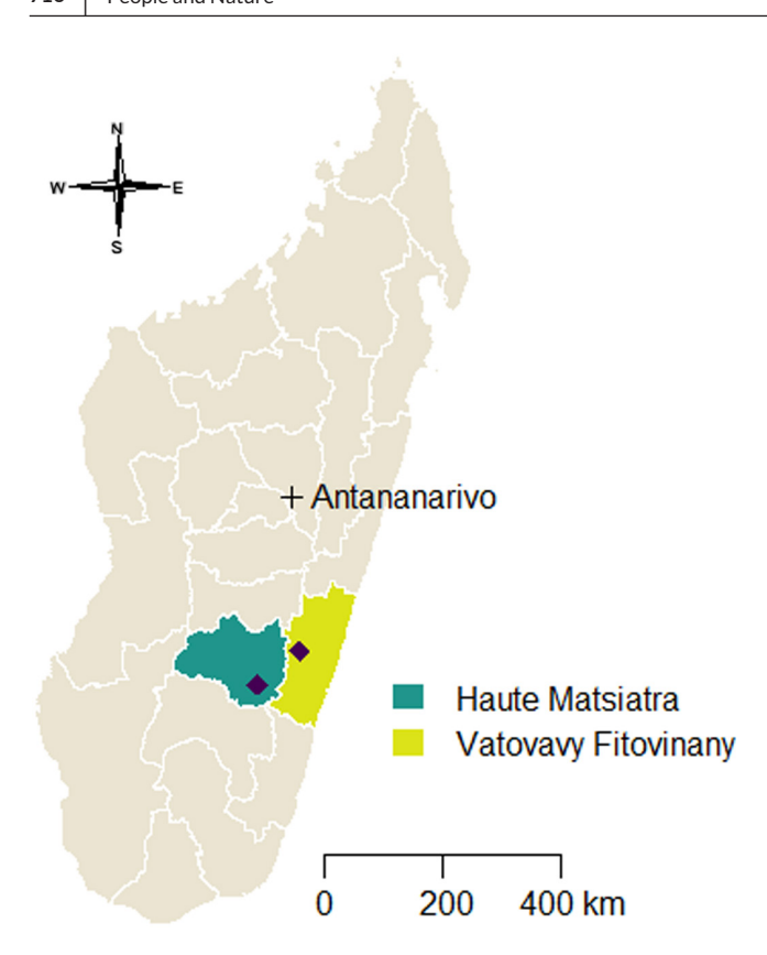
FIGURE 1 Geographical location of the two communes within which focus groups were conducted (indicated by ♠). The two communes are located in the Haute Matsiatra and Vatovavy Fitovinany regions (highlighted in green and yellow).

and the lead investigator (KS). Discussions began with a broad question on the types of agriculture practiced within the community, followed by a question on the challenges faced by farmers, and ended with a question on the participants' opinions on rats. The focus group schedule is provided in Appendix S2.